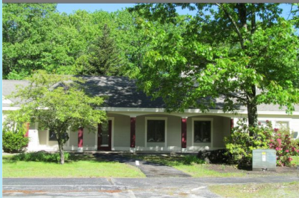
Front view | Main entry