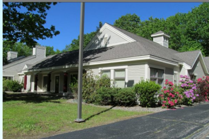
Front view | Side view