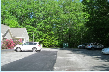
Side parking lot