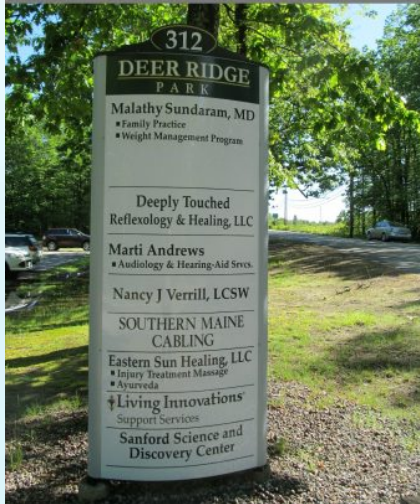
Main entrance signage